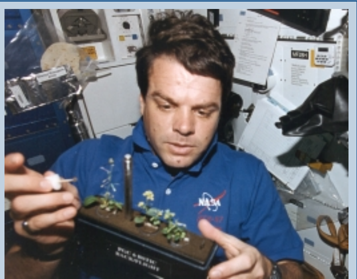
In a preliminary experiment aboard the space shuttle, Astronaut Kevin Kregel uses bee sticks to collect pollen grains from mature plants and transfer pollen to other plants for pollination and subsequent seed development. The same procedure was used by Astronaut Mike Foale aboard Mir for the Brassica experiments.

dioxide because the lack of convective air movement in microgravity prevented mixing inside the chamber. Just as humans fail to thrive when starved of oxygen, plants cannot thrive when starved of carbon dioxide.