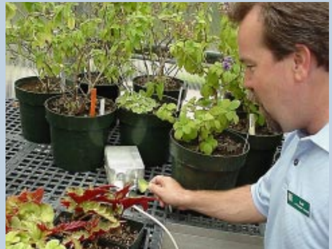
In a greenhouse test, the electronic nose was able to determine whether particular plants were blooming and when.

buildup of a contaminant from a slow leak, an astronaut may not notice an odor until the concentration is much higher than what an electronic nose would detect. Another weakness of the human nose, says Ryan, is that "if you get a really strong whiff of something, your nose just goes numb. You can't smell anything for a while. Your nose fatigues, and then you're just out of luck."